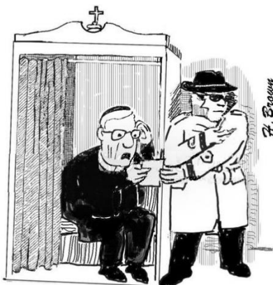
"WHAT'S THIS, A CONFESSION WRITTEN IN CODE...?"

WANTED: DONATIONS New soap & old candle stubs. Contact: Parish Office. A box will be placed in the foyer for these items.