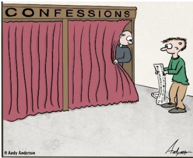
HOW MUCH TIME DO YOU HAVE?